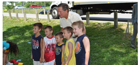
Governor John Kasich visiting children at the lunch program.

On Fridays, each child will receive enough food for six full meals to take home for the weekend. This extra "Backpack for Kids" program was developed by Governor John Kasich. Last year over 10,000 meals were distributed to Westerville area children. Additionally, one day per week, the Mid-Ohio Food Bank will return with their Produce Market Food Truck. This also is free. The Food bank truck brings hundreds of pounds of fresh produce. The fresh food is then distributed to our neighbors in need.