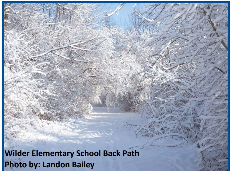
Wilder Elementary School Back Path

Stay connected with Blendon Township and be the first to know about the latest updates in our community.