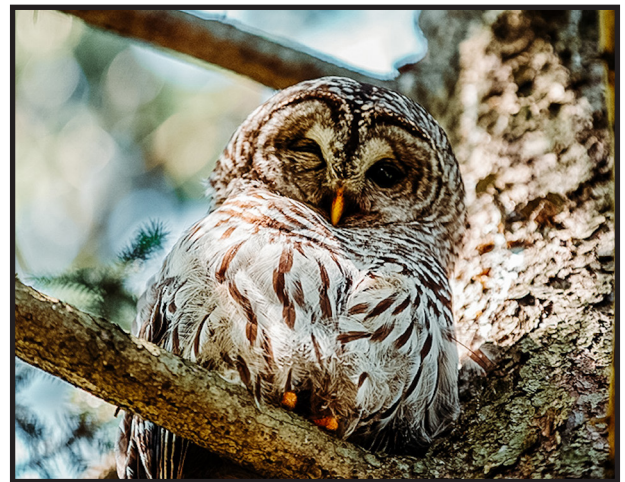
Ridgewood Park Nature Trails

A picture is worth a thousand words; help us tell the story of Blendon Township by submitting your photographs for our 2022 Annual Calendar Contest! If your photograph(s) are chosen for our calendar, you could win prizes! We will also feature some of your images in our newsletters and on our website. You can submit your photos now via email to jheichel@blendontwp.org . The submission deadline for next year's calendar is September 30, 2021.