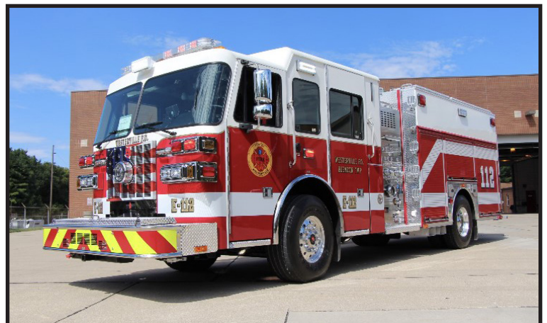
Blendon/Westerville Fire Engine 112.

During the paving operation, sections of each road will be closed or have restricted traffic and no street parking. Thank you in advance for your cooperation while we make these improvements.